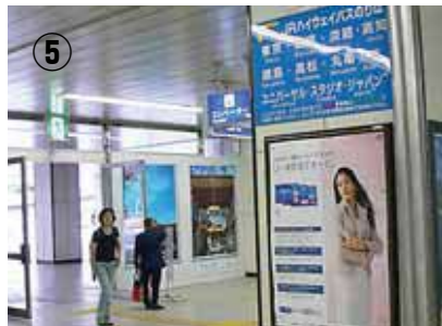
⑤ Down to the 1F, exit is on your left.