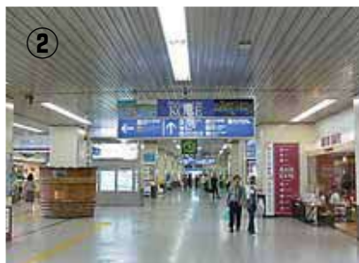
② Go straight following the sign of "JR Highway Bus (JRハイウェイバス)".