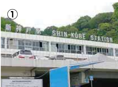
① Leave the JR bullet train (Shinkansen) at "Shin-Kobe Sta.". Entrance gate is only one and go out it.

Note : Refer to the map. Each number on the map has each route description as below ;