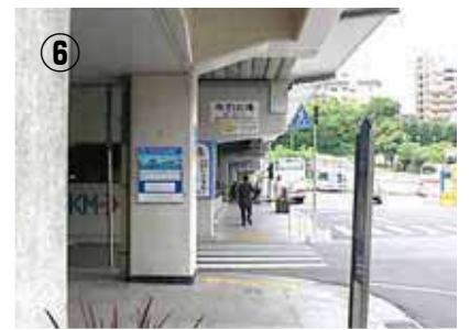
⑥ Out of the Sta., refer to the map. Turn left to the bus stop bound for "Tokushima (徳島)/Awaji-shima (淡路島) Area" and take the bus bound for "Higashiura BT". Get off at "Awaji Yumebutai-mae".