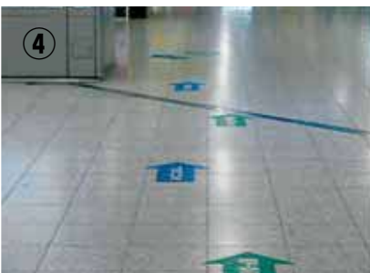
④ The sign on the floor (Photo).