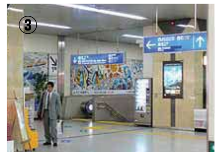
③ Follow the sign ( mark: → ) on the floor, and then you'll find the escalator and stairs go down to the 1F.