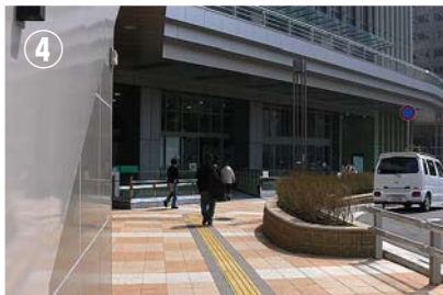
Pass by the escalator connects to 2F of "M-Int Kobe". The 1F of "M-Int Kobe" is "Sannomiya Bus Terminal (三宮バスターミナル)".