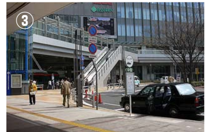
Walk along the rotary to "M-Int Kobe", business complex.