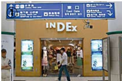
Go out the East Exit and turn right.

Note : Refer to the map. Each number on the map has each route description as below ;