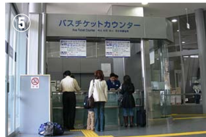
Enter the bus terminal entrance, for the bus ticket counter.