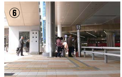
Take the bus at stop No.4, bound for "Higashiura BT". Get off at "Awaji Yumebutai-mae".