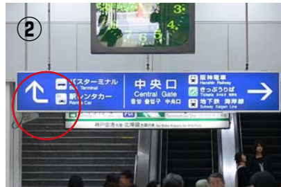
Follow the sign of "Bus Terminal" in front of the escalator and go diagonally left direction to the rotary.