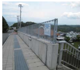
Reached at the top stair, turn right and go straight to the next stairs and go down it.