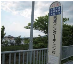
Get off the bus at "Higashiura IC".

Note : Refer to the map. Each number on the map has each route description as below ;