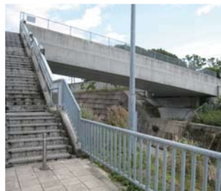
Go up the stairs near the bus stop.