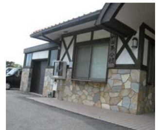
"Yamadahara Kaikan" (Community Center) is in front of you. Beside the front door of "Yamadahara Kaikan" a public phone is placed. Use it call a taxi.