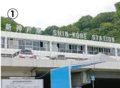
① Leave the JR bullet train (Shinkansen) at "Shin-Kobe Sta.". Entrance gate is only one and go out it.

Note : Refer to the map. Each number on the map has each route description as below ;