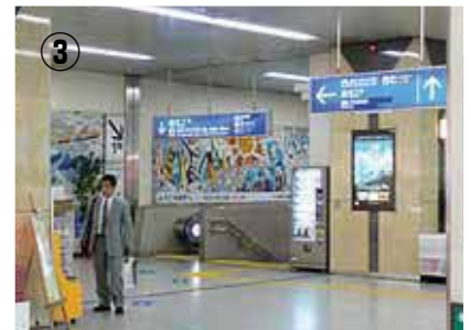
③ Follow the sign ( mark: → ) on the floor, and then you'll find the escalator and stairs down to the 1F.