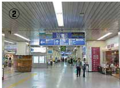
② Go straight following the sign of "JR Highway Bus (JRハイウェイバス)".