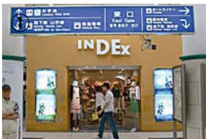
Go out the East Exit and turn right.

Note : Refer to the map. Each number on the map has each route description as below ;