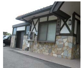
"Yamadahara Kaikan" (Community Center) is in front of you. Beside the front door of "Yamadahara Kaikan" a public phone is placed. Use it call a taxi.