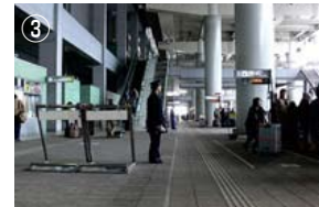
Bus stops are on the outside of the exit. Ticket vending machine is on the left.