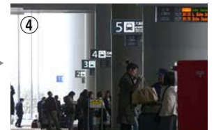
A : To "Sannomiya" Take the bus at stop No.6, bound for "Kobe Sannomiya/ Rokko Island (六甲アイランド)". B : To "Higashiura IC" Take the bus at stop No.2 (South side), bound for "Awaji (淡路) / Naruto (鳴門) / Tokushima (徳島)".