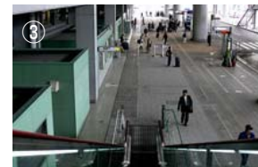
Bus stops are on the outside of the exit. Ticket vending machine is on the left.