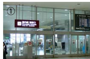
After baggage claim go out to the arrival lobby on the 1F.