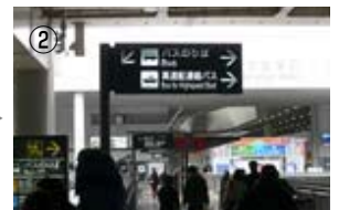
Airport Terminal Exit is in front of you.