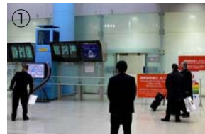
After baggage claim go out to the arrival lobby on the 1F.