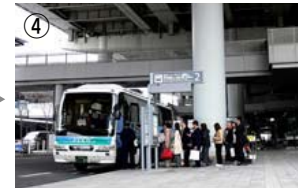
A : To "Sannomiya" Take the bus at stop No.6, bound for "Kobe Sannomiya / Rokko Island (六甲アイランド)". B : To "Higashiura IC" Take the bus at stop No.2 (South side), bound for "Awaji (淡路) / Naruto (鳴門) / Tokushima (徳島)".