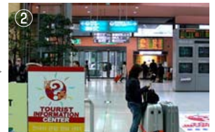
Airport Terminal Exit is in front of you.